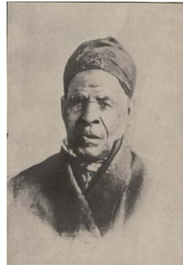
Omar ibn Sayid (1770-1864)