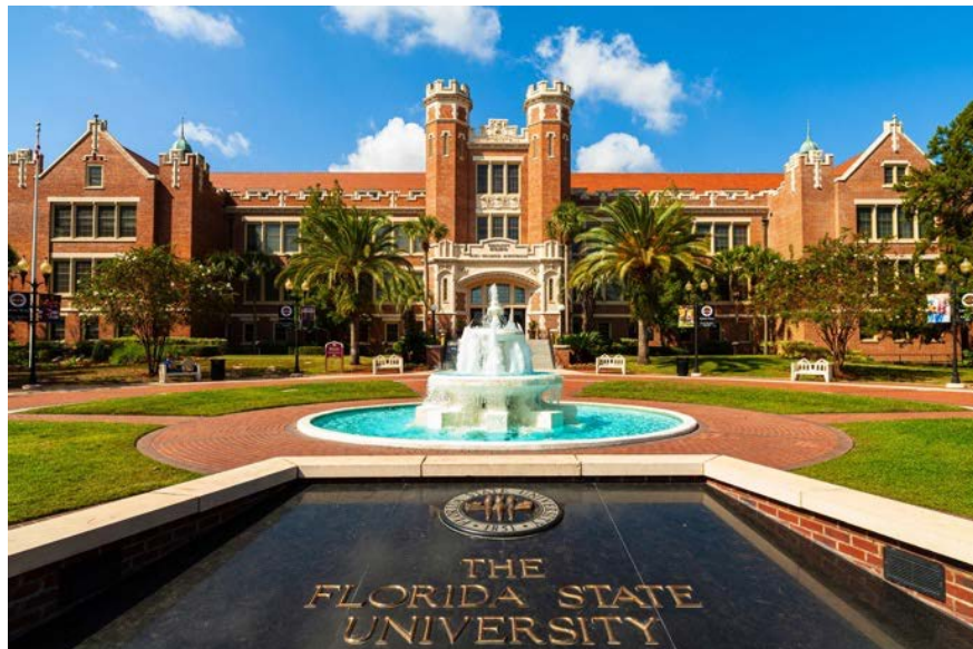
Westcott Building, Florida State University