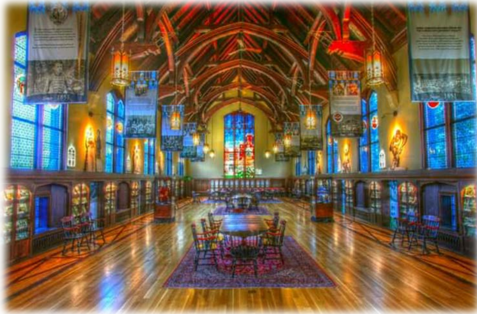
Florida State University Heritage Museum in Dodd Hall, Home of FSU's Department of Religion

March 11 – 13, 2022, Online (All Events Scheduled in Eastern Time)