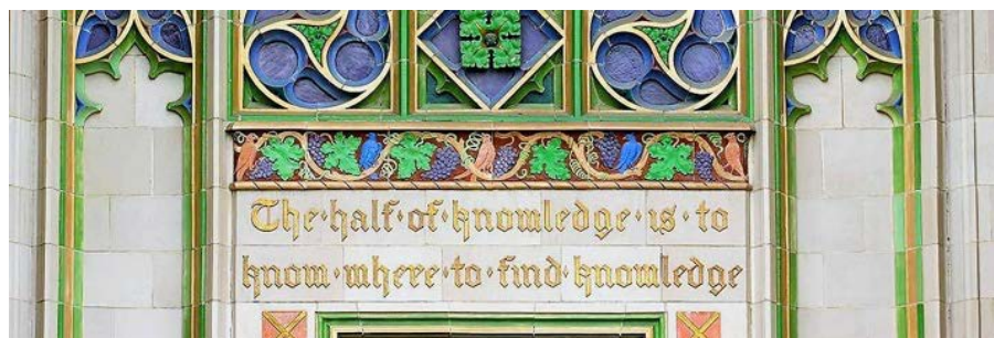
Façade of Dodd Hall, Home of FSU's Department of Religion