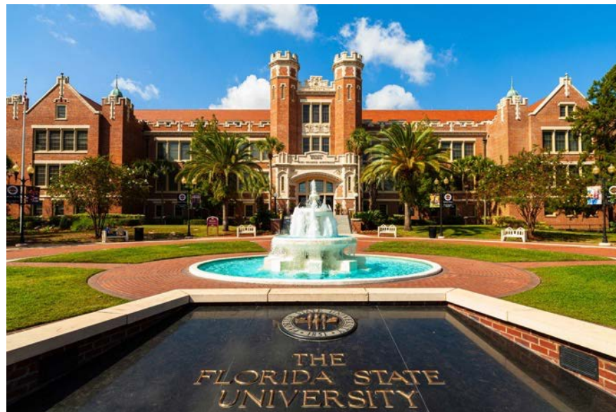
Westcott Building, Florida State University