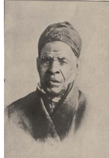
Omar ibn Sayid (1770-1864)