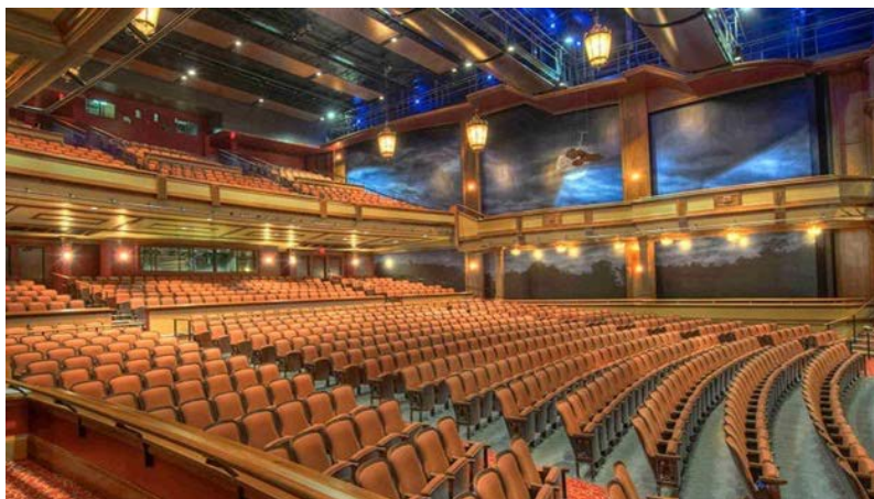
Florida State University's Ruby Diamond Concert Hall, Westcott Building