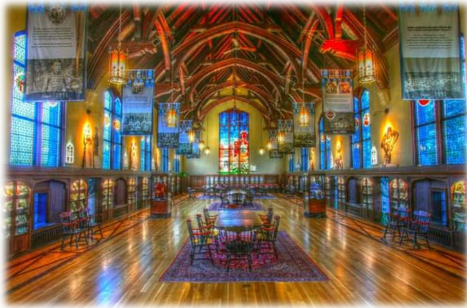
Florida State University Heritage Museum in Dodd Hall, Home of FSU's Department of Religion

March 11 – 13, 2022, Online (All Events Scheduled in Eastern Time)